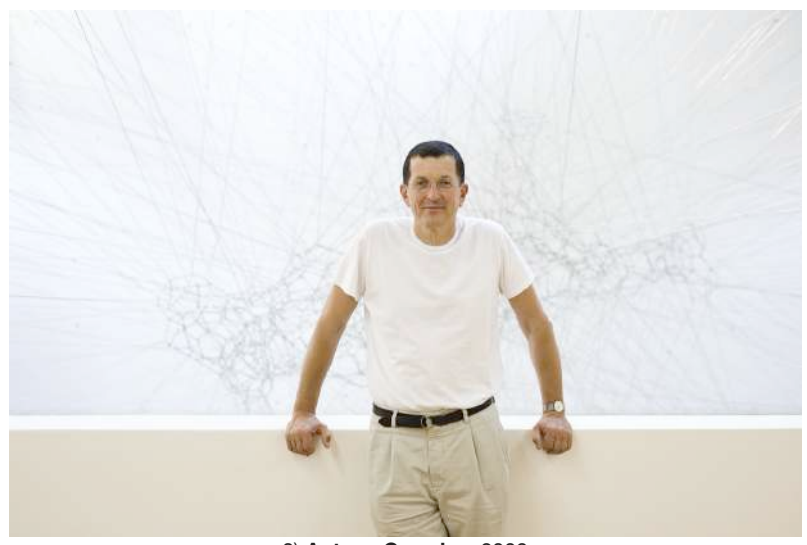
3) Antony Gormley, 2009